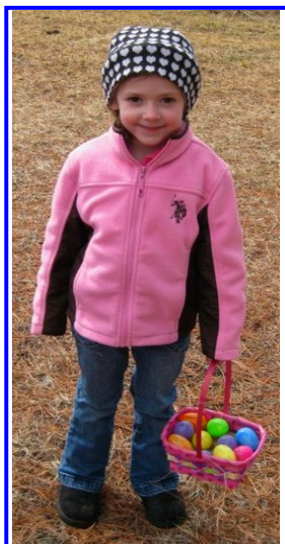
'Egg'Cellent Results from the 2010 Egg Hunt!